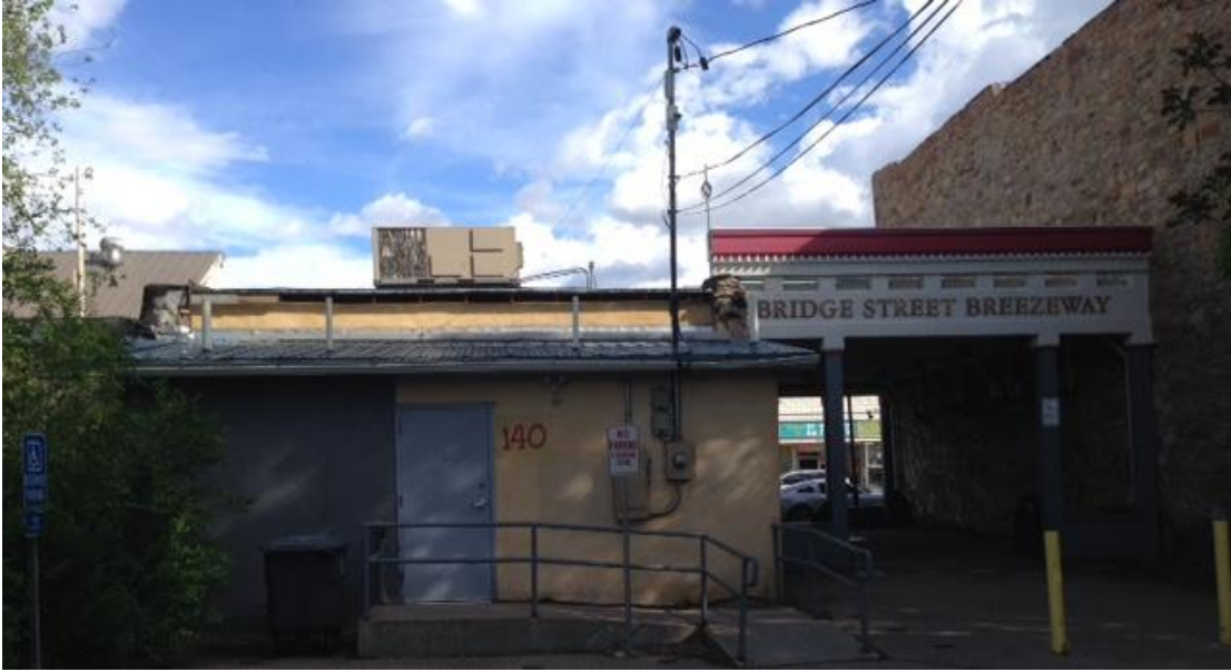
Faces north toward parking lot

This is the parking lot entrance to the Bridge Street Breezeway.